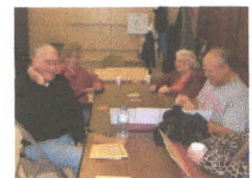
Licensed Bingo is played every Monday and Wednesday morning from 9:30 to 11:30. It is open to everyone over 18 and is $1.00 per card for 13 games of bingo.

Other adult programs, community services, and social/hobby activities that are enjoyed by all ages are listed on page 4 under "Groups That Utilize Willard".