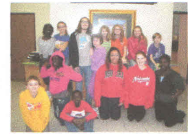
The teen group takes time out from homework to take a group shot after school.