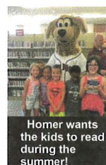
Homer wants the kids to read during the summer!

Summer Program held this year at Roper Elementary School was open M-F from 6:30 am to 6:00 pm. The children were placed in age appropriate groups (K-1st, 2nd-3rd and 4th-8th grades) and participated in weekly fun themed and educationally based activities. The children went swimming and on a field trip every week. A total of 148 children, kindergarten through 8th grade, were enrolled for the summer.