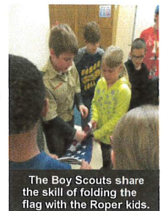
The Boy Scouts share the skill of folding the flag with the Roper kids.