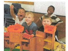
We love playing together in the after school program.

Roper Elementary Before and After School Program held at 2323 S. Coddington Street ran from 6:30 am to the start of the school day and resumed after school until 6:00 pm. This program offered a healthy snack after school and a wide variety of activities, ranging from daily scheduled events to large group games and homework time. This program included child care when school was not in session. The unduplicated count for this program was 163 children with 13 families on a waiting list.