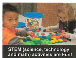
STEM (science, technology and math) activities are Fun!

Lakeview Community Learning Center Before and After School Program held at 300 Capitol Beach Blvd. ran from 6:30 am to the start of the school day and resumed after school until 6:00 pm. Willard is the lead agency for this CLC and received additional funding from the 21st Century Community Learning Centers Grant Program. This grant supports academic enrichment opportunities as well as additional activities designed to compliment the school's academic program. After school clubs were offered to all students in the school at no charge. The unduplicated number of children that participated in the CLC was 296. Fifty eight children were enrolled in the core before and after school program and attended 30 + days and 280 participated in the academic/enrichment after school clubs.