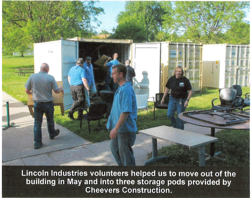
Lincoln Industries volunteers helped us to move out of the building in May and into three storage pods provided by Cheevers Construction.

The multitude of other groups that normally met in the building had to find alternative meeting spaces. Our wish is that they all come back to utilize our new and improved building.