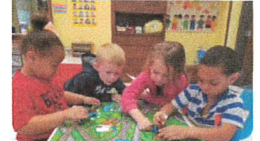
Preschoolers love learning about Thomas the Train.

Preschool for 3-4 year olds held at the Center focuses on letter and number recognition, shapes, colors, cognitive and fine motor skills, and language skills. Activities include math, science, library, dramatic play, and many educational learning activities. Thirty children participated.