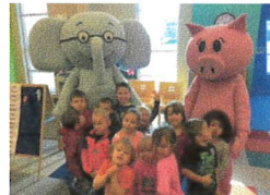
Elephant and Piggie teach the children about kindness and sharing.

Pre-K for 4-5 years olds held at 1030 West "Q" Street has a curriculum that focuses on developing skills that prepare them for kindergarten. Daily activities and weekly themes encourage multi-cultural awareness and parent involvement. Learning centers include math, science, language, literacy, blocks, and dramatic play. Seventeen children participated.